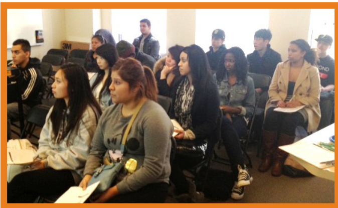
Scholars learn great information at a financial aid workshop.

If the Maisin staff needs to contact you, depending on the circumstance, we will first attempt to reach you by email. If we are unsuccessful, we will call your cell phone followed by your home phone. Finally, we will send home a letter in the mail. Please keep your contact information up to date. Also let us know if you have Facebook or Twitter as we use these avenues to send out information to scholars as well.